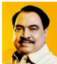
Sh. Eknath Khadse