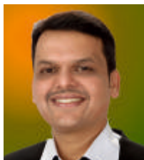
Sh. Devendra Phadnavis