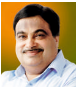
Sh. Nitin Gadkari