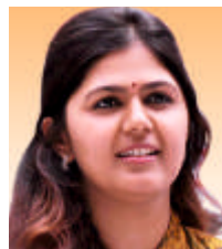
Smt. Pankaja Munde